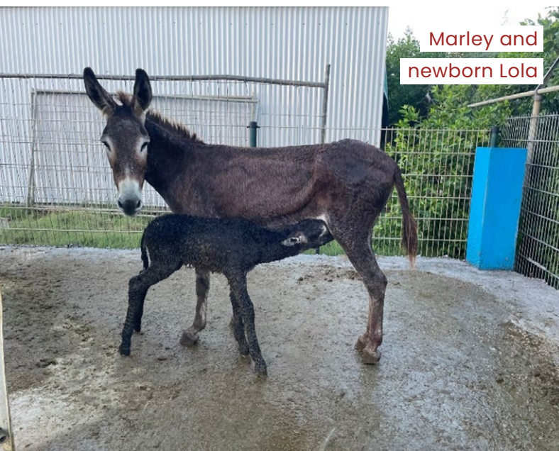
Marley and newborn Lola

Djenn and Riva are inseparable in the care meadow, and now they are also together in the large park. Djenn came in as an orphan in December 2022, and Riva arrived with her mother Raya in May 2022. Raya was pregnant and gave birth to her son Ilja in May 2023. They now all live together in the large park. Marley gave birth to her daughter Lola in November 2022, and now they stand strong together in the large park.