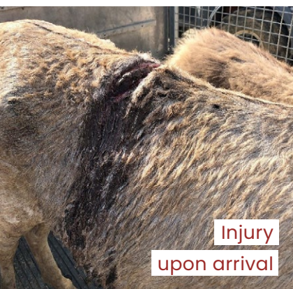
Injury upon arrival