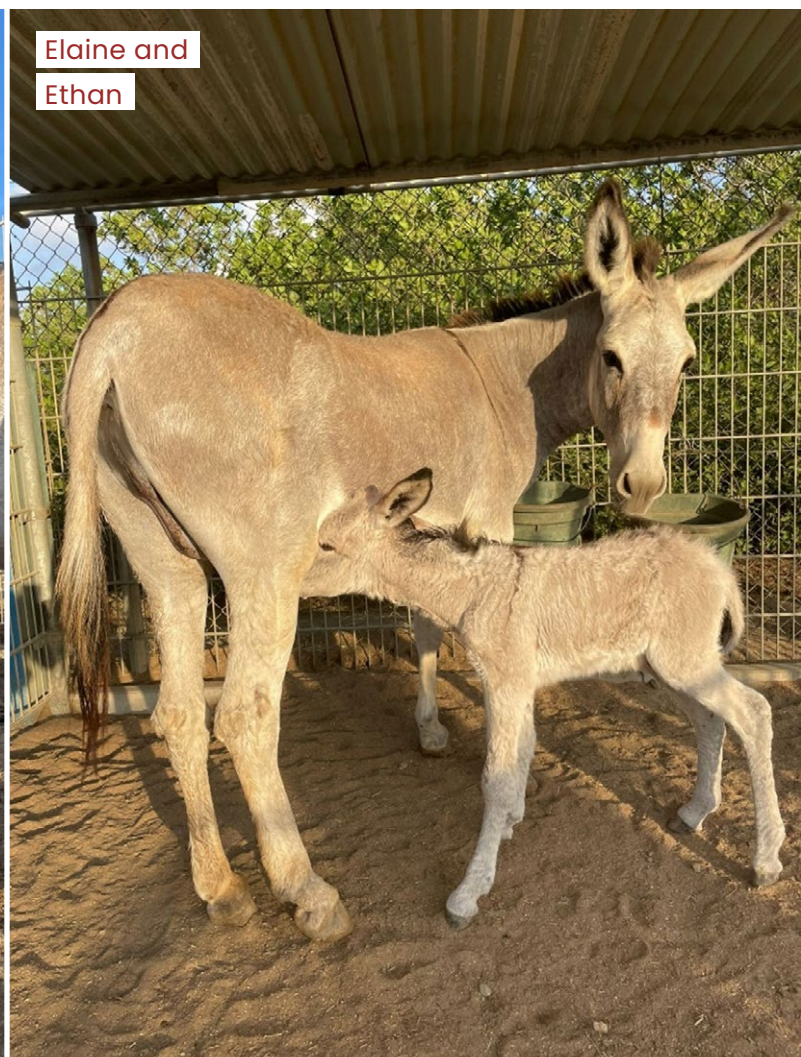
Elaine and Ethan