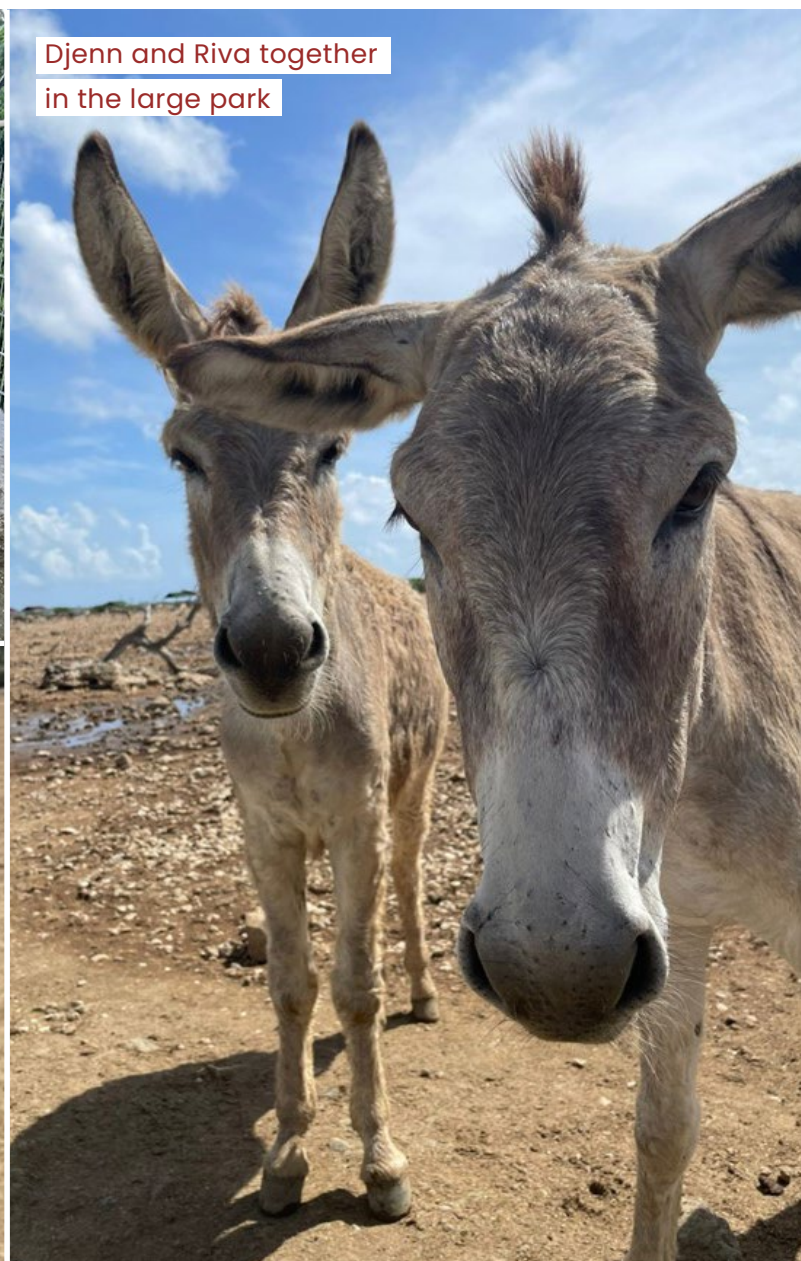
Djenn and Riva together in the large park